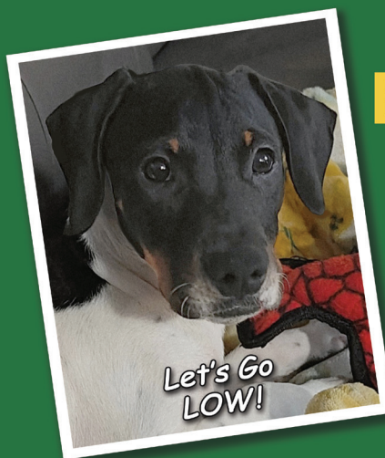
BRUTUS Newest King Family Canine

a TON of points last week. 10-0 OU s'2012 : All Same-DIVISION games when BOTH teams allowed 38 > pts last week (CARDS vs NINERS), and the OU line is 43.0 or higher... The Cards lost by 22 points last week while the Niners lost by 16 points. 9-1 OU s'2019 : All GAME 16 < home DOGS of +2 > pts (CARDS vs NINERS), when BOTH teams are off a big loss of 15 > pts last week, and the OU line is > 37.0 points... Last week, the host Seahawks ran ALL OVER the Cardinals (pun intended), with 198 rushing yards. So far THIS year, NFL teams who allowed 190 > rushing yards on the ROAD have gone 9-1-1 OU in their next game (CARDINALS)... Speaking of rushing numbers, the 49ers are very WEAK in that department this season. They're averaging only 94 rushing YPG and are DEAD LAST in yards per rush (3.5). 9-1 OU last 3 years : All GAME 5 > road favorites of > 1 pts who average 3.6 or less yards per rush (NINERS), when the OU line is 38.0 or higher... Current Team Trends seal the deal. NINERS: 7-0 OU aft div HG... 4-0 OU vs sing revenge... 3-0 OU aft Rams... 7-1 OU in L8 div RG... CARDINALS: 5-0-1 OU aft Seat... 6-2 OU L8 div HG.